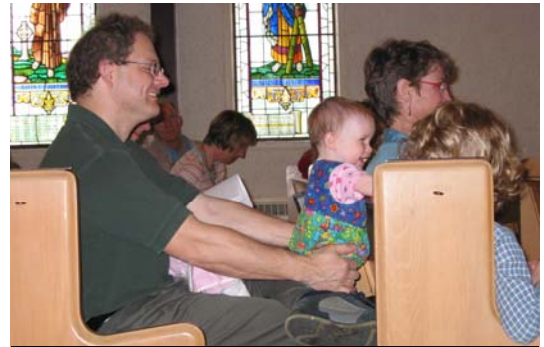
PEW FUN before Children's Time